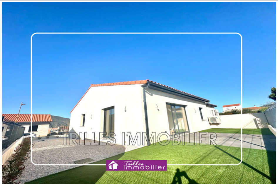
Villa 1406 Vinça

Great opportunity!!! 3-sided villa to be launched, never lived in. Built in traditional &quot;Brick&quot; style, you will discover a living area of 85 m 2 + a garage of 14 m 2 . All on a plot of 284 m 2 . A pleasant tiled terrace accessible from the spacious, functional living room bathed in light. It will also offer you quality services such as ducted air conditioning throughout the villa; a thermodynamic water heater; double glazing, electric shutters, etc. On the night side, it has three large bedrooms, each with space for a dressing room. A beautiful modern bathroom with walk-in shower will complete the sleeping area. The plus points: A fully tiled garage with motorized door as well as a parking space at the front of the house.