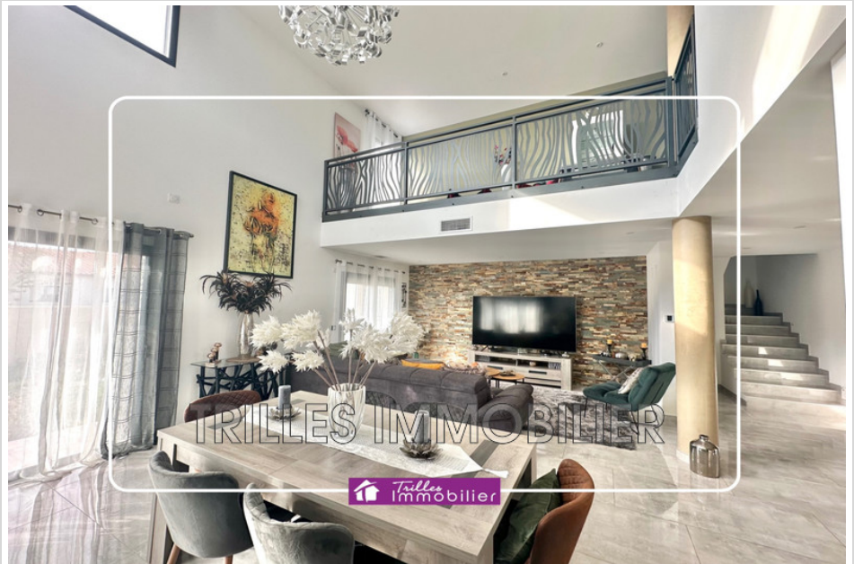
Villa 1419 Ortaffa

ORTAFFA - New 3-sided villa from 2022 under ten-year warranty. Come and discover this magnificent 3-sided villa of approximately 167 m 2 with its fully tiled and insulated garage, built on a plot of 399 m 2 . It is composed on the ground floor of a splendid, very bright cathedral living room adjoining a magnificent and spacious, fully equipped kitchen, giving access to a terrace and its perfectly exposed garden. The beautiful master suite with its dressing room and private bathroom with a walk-in shower and toilet allows you to enjoy the villa on one level. The upper floor offers two large bedrooms with large, fully fitted closets. The superb bathroom with its bathtub and walk-in shower as well as its separate toilet will complete this floor. The exterior will offer you the opportunity to finish fitting it out according to your tastes and desires in order to be able to enjoy the peace and quiet on sunny days. The most +++: - Large Volumes - Ducted air conditioning - Thermodynamic water heater - Electric garage door - Ten-year guarantees